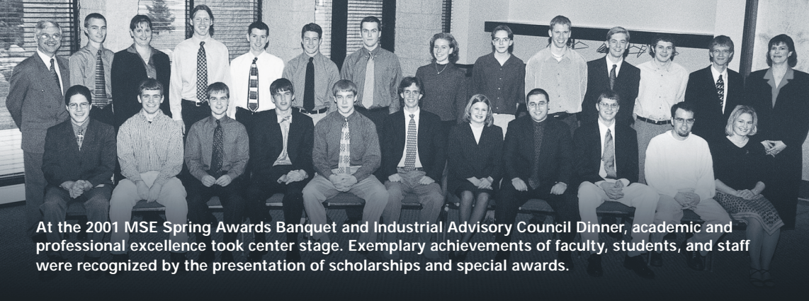
At the 2001 MSE Spring Awards Banquet and Industrial Advisory Council Dinner, academic and professional excellence took center stage. Exemplary achievements of faculty, students, and staff were recognized by the presentation of scholarships and special awards.